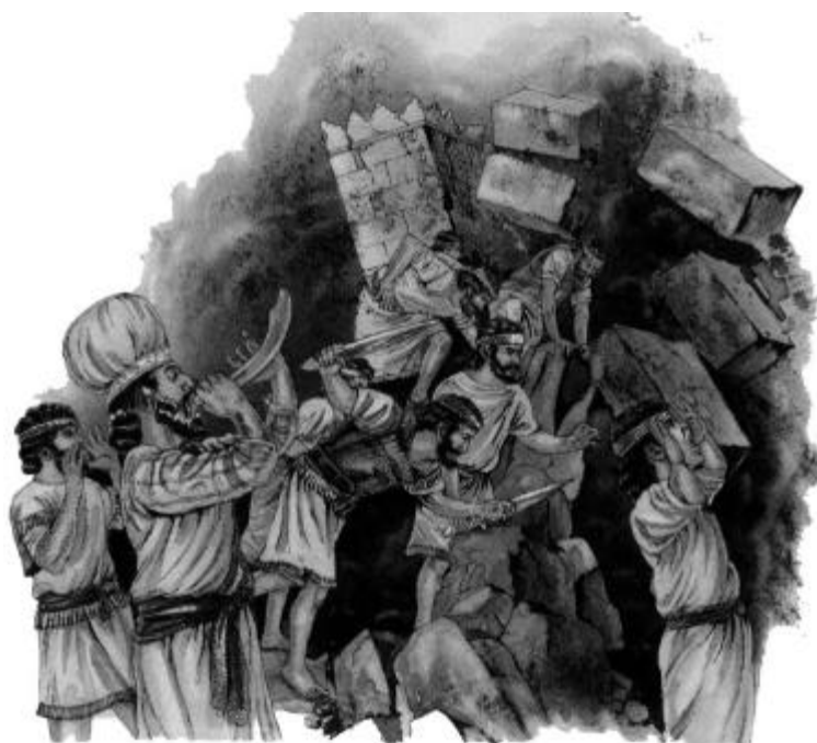
The collapse of Jericho

We will cover the 12 chapters in nine sessions, as follows: